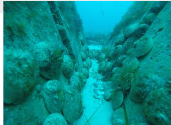
Wylie Bay – October 2018.