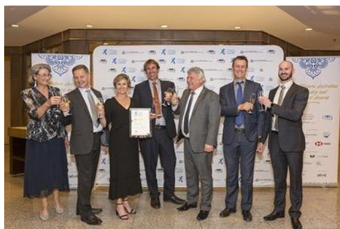
OGA team acceptance of ECA sustainability award