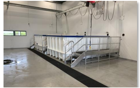
Live tanks installed – Facility, Augusta Boat Harbour

The installation of live tanks at the new processing facility at the Augusta Boat Harbour was completed and provides OGA increased capacity to deliver its premium, live, greenlip abalone into local and Asian markets.